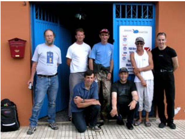
Outside the dive centre