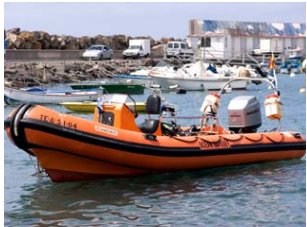
Ocean Odyssey RIB