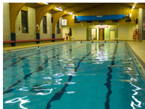
View of the pool at the centre

The club recently featured in an article in the Swindon Evening advertiser. The photograph to the right was taken on the night. See the link on our website at: http://www.seahorsediveclub.co.uk/news.htm