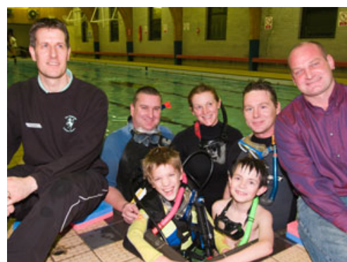
A recent photograph at the pool